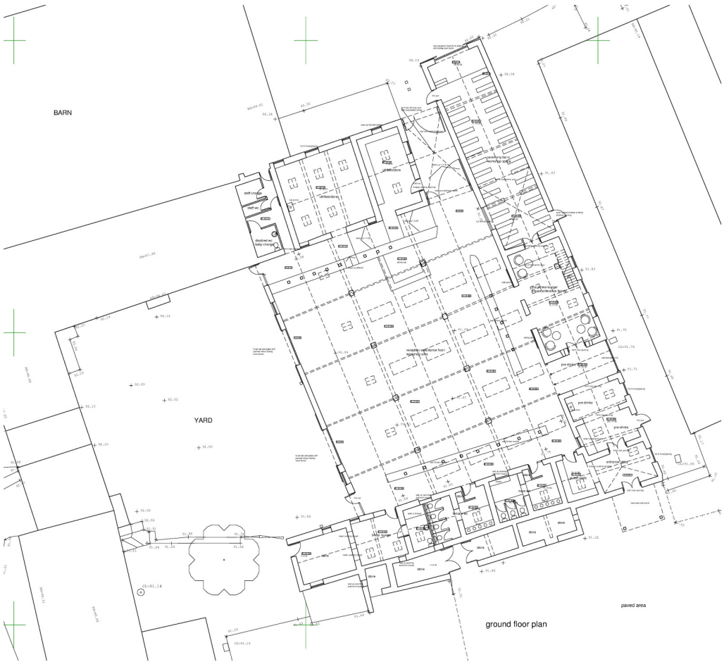
ground floor plan