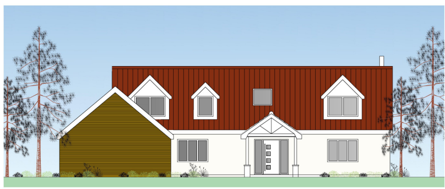
Front Elevation - North