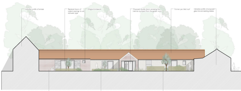
C Proposed - Stables & Courtyard South Elevation Scale 1:100