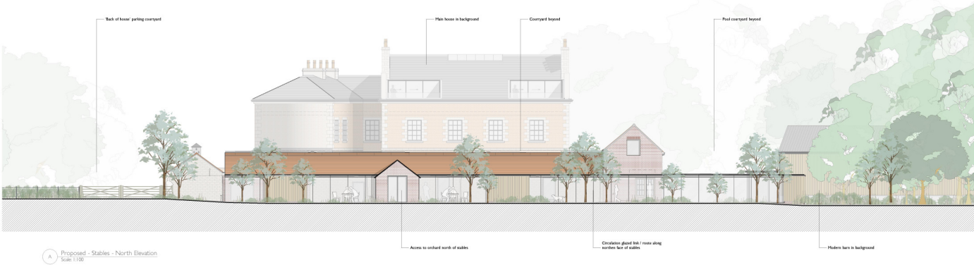
A Proposed - Stables - North Elevation Scale 1:100