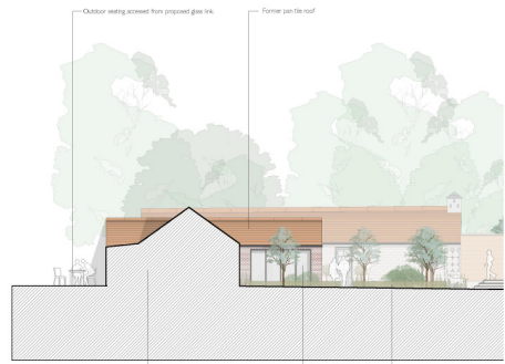
B Proposed - Garden Room West Elevation Scale 1:100