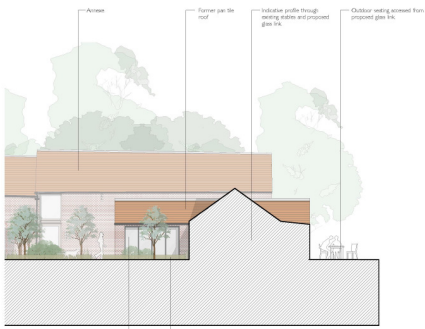
A Proposed - Garden Room East Elevation Scale 1:100

These elevations were based on the existing site conditions and existing building footprint. They are not intended to be a final design and are subject to change. All dimensions and materials are subject to change without notice. The final design shall be based on the final design of the building and site.