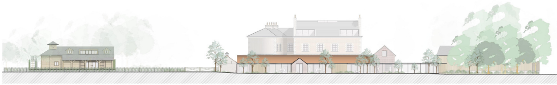
B Proposed - Site Elevation North Scale 1/200