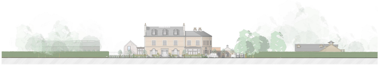
A Proposed - Site Elevation South Scale 1/200