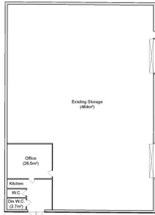
AS EXISTING GROUND FLOOR PLAN (Scale 1:150)