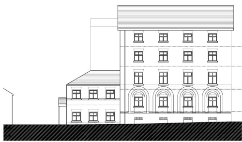
NORTH ELEVATION (CARPENTERS YARD)