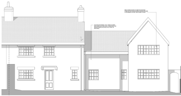
FRONT ELEVATION (NORTH)