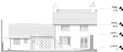
REAR ELEVATION (SOUTH) 1 : 100