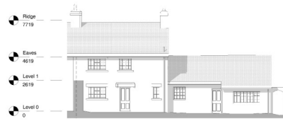
FRONT ELEVATION (NORTH) 1 : 100