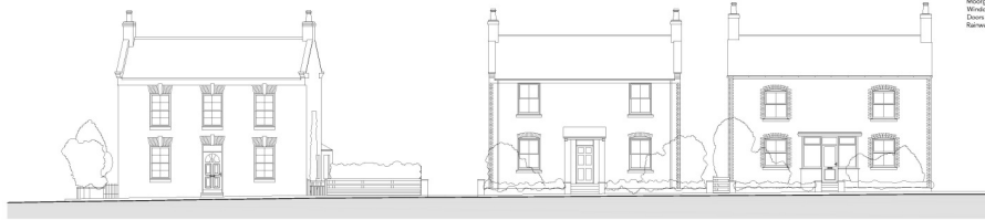
PROPOSED STREET ELEVATION