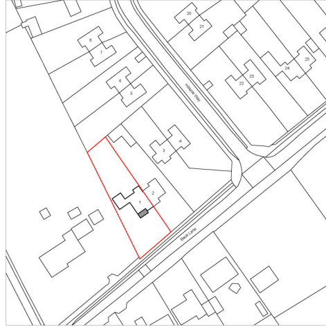
Proposed Block Plan Scale 1:500 Licence No: 100047474