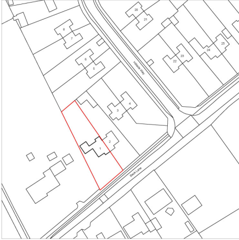
Existing Block Plan Scale 1:500 Licence No: 100047474