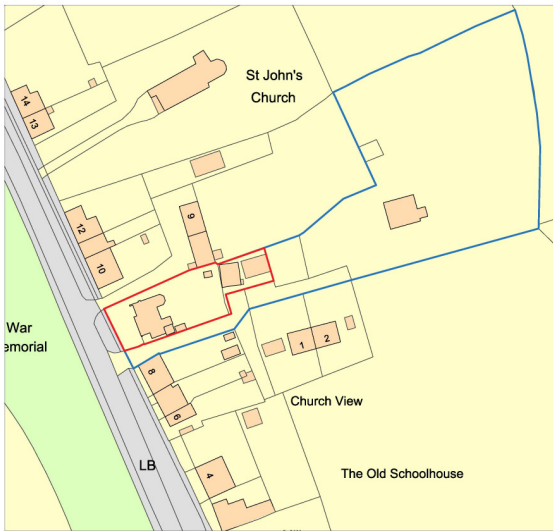
1 01 Location Plan 1:500